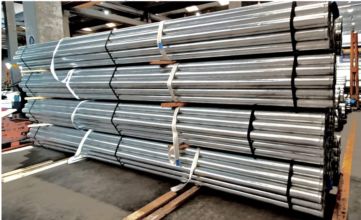
Figure 1: visual representation of the product

Visual representation (e.g., an image) of the product